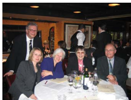
Signing the contract for the new Journal

We would like to offer congratulations to all those people who have become